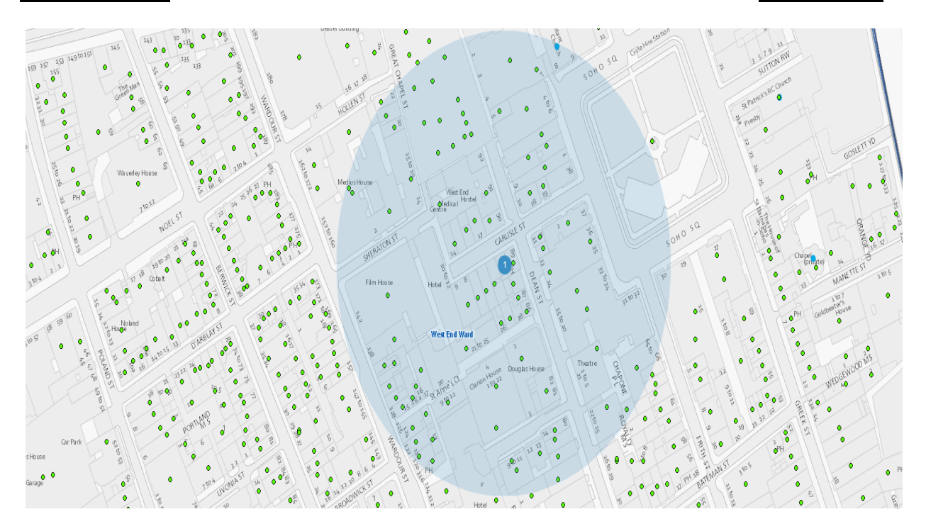
0 = Sex establishment